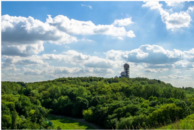
Grünwald - Berlin